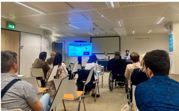
(picture: EESC visit during the field trip – JM CoE TIA2030 materials)

From September 15, 2024, till September 19, 2024, we successfully organised a multi-day joint international field trip to Belgium and Luxembourg. During the field trip, participants had the opportunity to visit some of the key European Union institutions and organisations: the EU Parliament, where we learned valuable insights into how the European Union's law-making body functions and its role in shaping policies that align with global objectives like the UN Agenda 2030 for sustainable development; the European Economic and Social Committee (EESC), which provided a comprehensive understanding of how civil society influences EU policies and how these policies contribute to achieving Agenda 2030; Scotland House in Brussels, which offers a highly integrated presence of Scotland in EU, delivering services that foster Scotland's economic growth, diplomatic relations, and cultural promotion at the EU level, also providing a view of how Scotland is committed to Agenda 2030, contributing to the EU's broader sustainability goals.